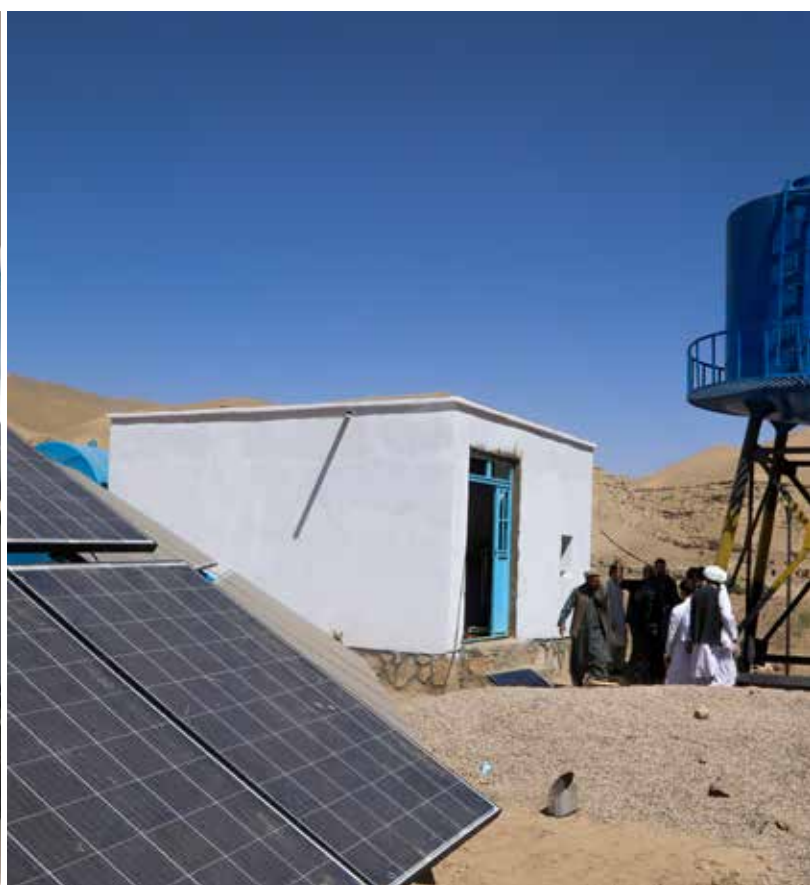
An innovative approach - an RO operator, unit and water treatment system - treating highly saline water to become a safe drinking source, powered by solar energy for sustainability.

“We value the RO unit. Before, there were so many illnesses from drinking bad water or boys who were lost while walking long distances to collect water. The route is not secure. Now, we have drinking water right here, and almost no illnesses anymore. We protect the RO with a guard and a fence we built. When there is fighting, we ask them not to attack the RO ahead of time. Our RO was still damaged once, but we worked together to quickly repair it. It has changed our village.”