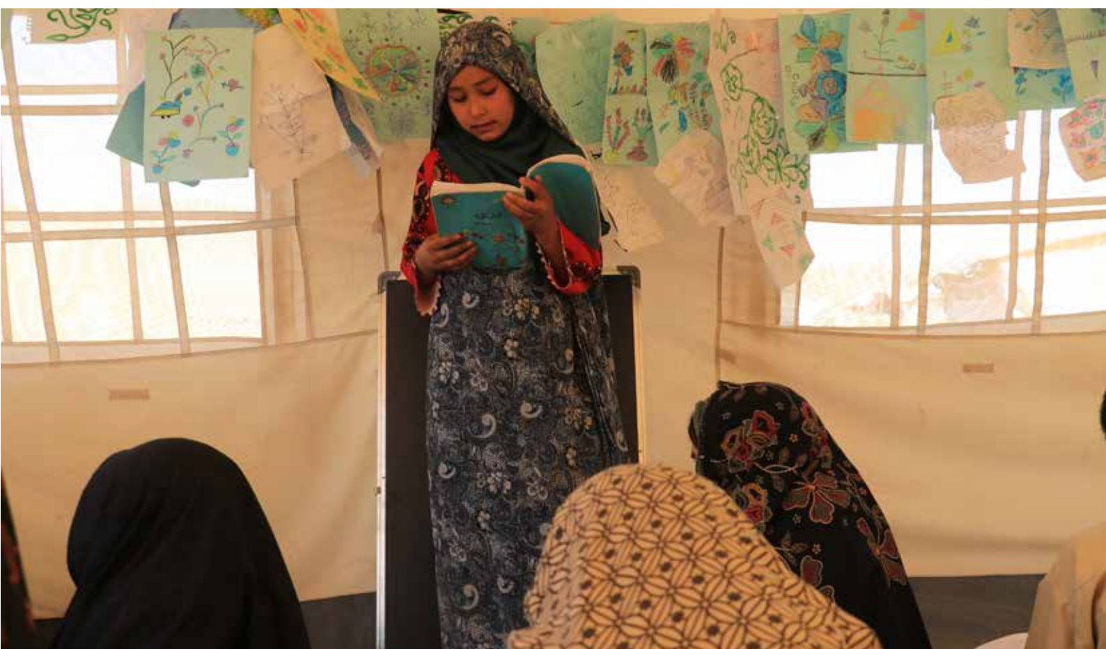
Education in a Temporary Learning Space for children displaced by the 2018 drought emergency. Priority is placed on ensuring opportunities for girls' education to help address gender inequality.

June 2020. In addition, 35 million people are in need of a social safety net – demonstrating the need for humanitarian and development solutions to work across the nexus to address the sweeping impacts of COVID-19. 16