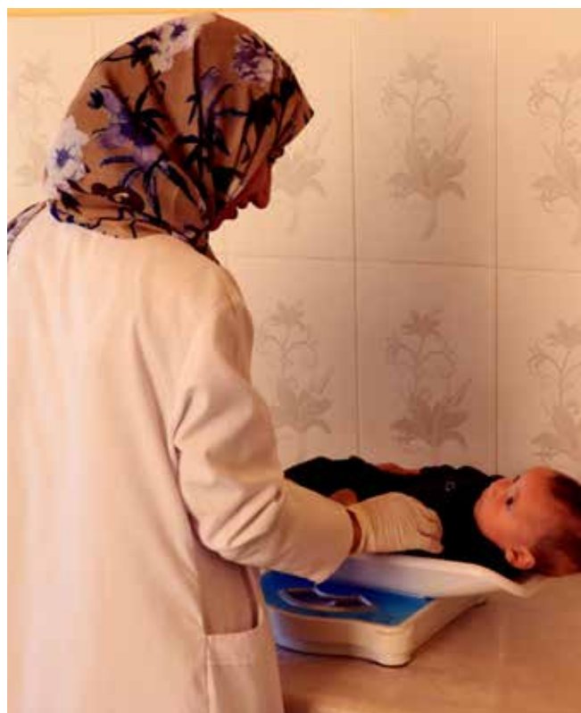
A midwife treats an infant in a Family Health House, bringing health services closer to home in Herat province.