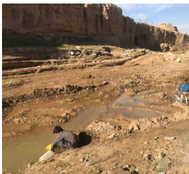
Before World Vision’s interventions in Abkamari, Badghis province, most children only had access to poor quality surface or groundwater.

Though the 2018 drought brought western Afghanistan’s population to the brink of life and death, the challenge to access clean drinking water in Badghis province has been chronic. The most available source is groundwater, but the salinity has been too great to consume safely. Among displaced people, 58 per cent do not have access to water and 65 per cent of returnees from Iran, now in and around Herat, do not have access to water and sanitation services. COVID-19 has increased the number of people in need of clean water, sanitation and hygiene items by 2.3 million people as of June 2020, in particular to help improve access to hand washing and hygiene. 29