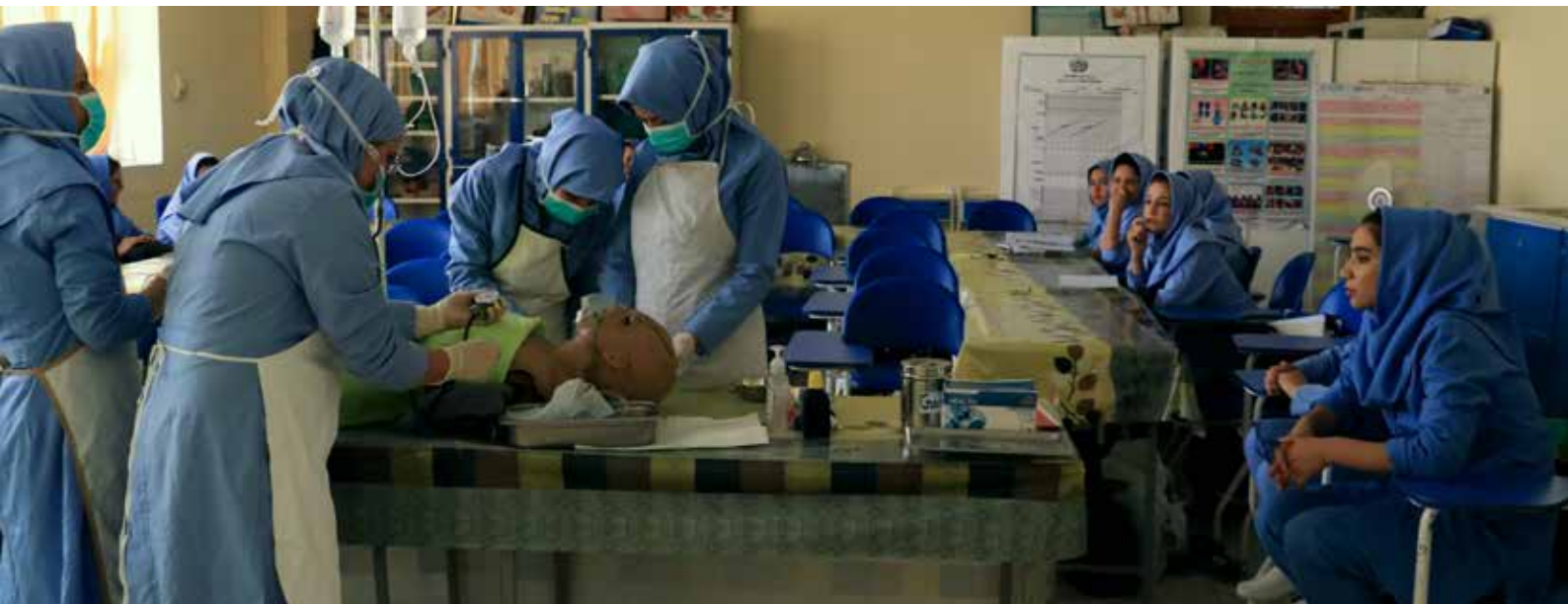
Female students studying midwifery at the Herat Institute of Health Sciences, supported as part of World Vision's MNCH programming.

World Vision's health programming in Afghanistan has naturally flexed between 'humanitarian' and 'development' approaches, driven by advocacy to highlight health system gaps and needs, identify resources from humanitarian or development donors, and merge these resources into a coherent nexus approach. In practice, this has meant the short-term and medium-term deployment of mobile health teams to drought-affected displaced populations, and now to communities affected by COVID-19. Mobile health teams target communities that continue to be affected by displacement, but also reach communities in 'white areas' at risk of COVID-19 that lack basic health services. Mobile health teams complement World Vision's long-term commitment to strengthening health systems and extending MNCH services in hard-to-reach, rural and remote areas affected by chronic underdevelopment – a 'joining up' of humanitarian and development approaches. Two of the most important initiatives exemplifying a nexus approach have been the midwifery training programme