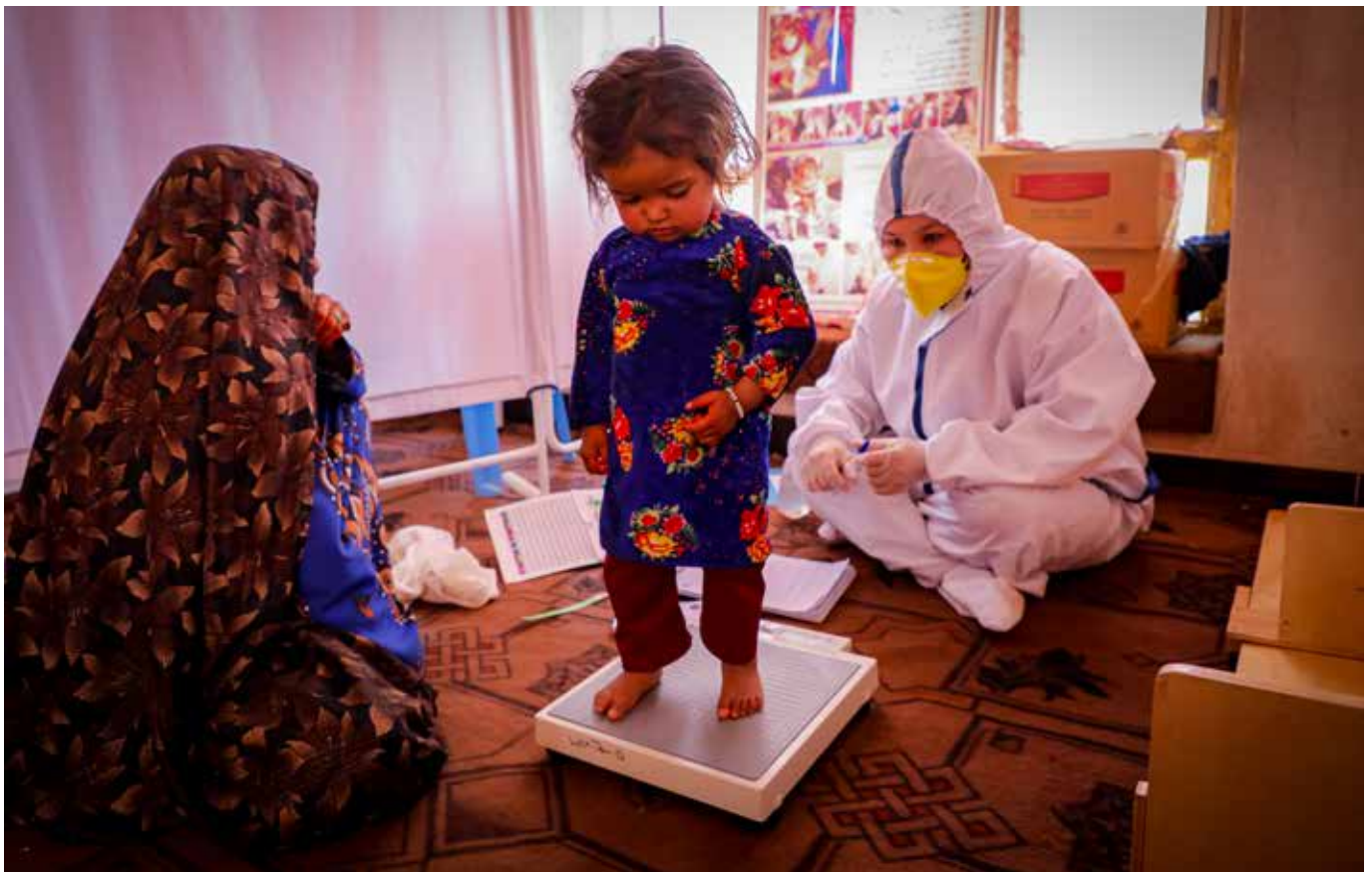
A nutrition nurse from World Vision's mobile health team continues nutrition screenings during COVID-19 response.