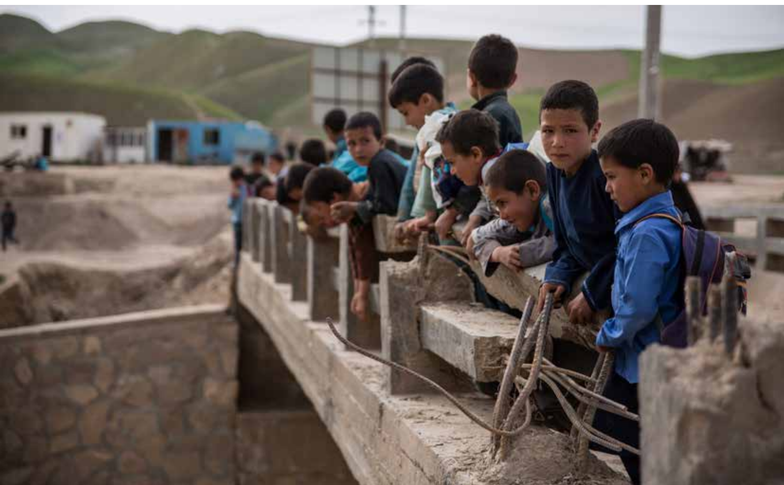
After school, children outside of Qala-e-Naw, Badghis province, stand on a bridge to watch people below washing clothes and carpets.

humanitarian funding. This can create a lengthy process to advocate with bilateral humanitarian donors for the acceptance of interventions that practically meet needs but may colour outside of the cluster-prioritised lines.