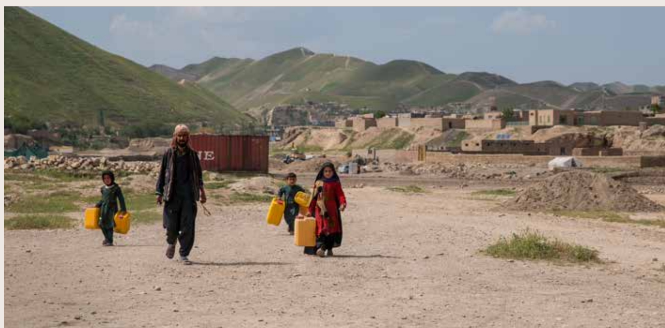
Safe drinking water collection possible now in Chahkaran, due to the introduction of reverse osmosis water treatment.

In many ways COVID-19 not only demands but increases the stakes for the necessity of a nexus approach. The same families in ‘white areas’ reached today in emergencies by mobile health teams need accessible primary healthcare tomorrow; families needing food and cash assistance today due to loss of employment need sustainable strategies to recover lost livelihoods. COVID-19 has demonstrated that a coherent approach, driven by evidence-based assessment of needs and gaps, has never been more critical. Many NGO actors such as World Vision have the experience and best practices to realise the nexus – what is needed now is for all stakeholders to continue to breakdown their silos and invest in these solutions.