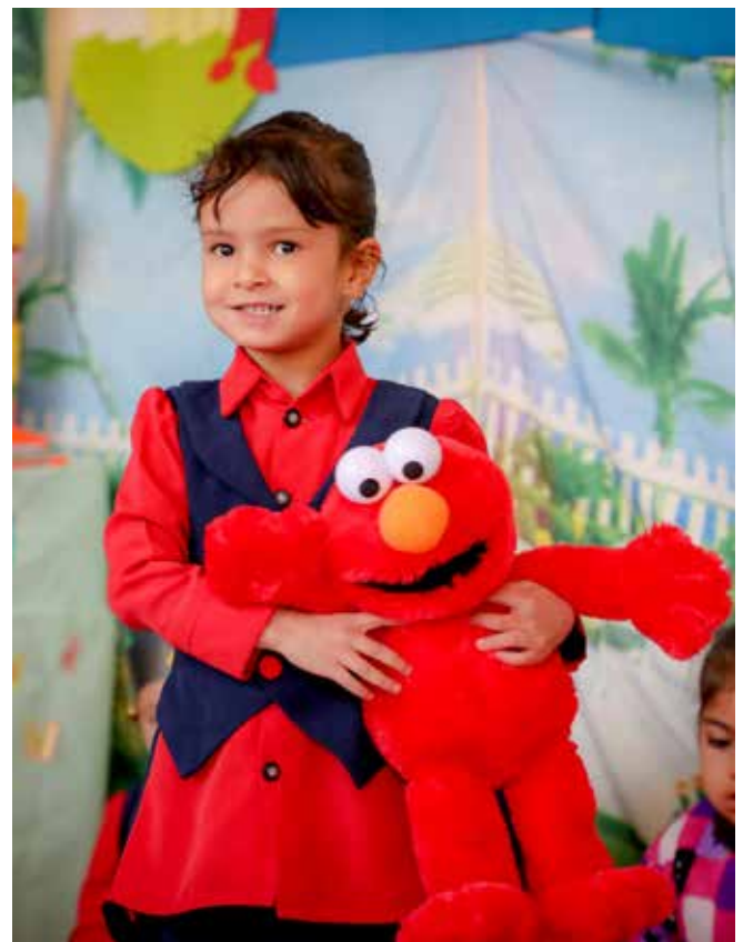
A six-year-old girl learns and plays at an ECD centre in Badghis.

ECD has not been well incorporated into EIE in IDP settlements either. This has been due to a lack of resources, a prioritisation of short-term interventions, and a reported perception that ECD is ‘development’ or a ‘luxury’ and therefore not life-saving for displaced children. Absence of durable solutions for IDP children effectively result in their learning experience within a TLS functioning as regular primary education, and thus the benefits of ECD as an early entry point to education, particularly for girls, is just as essential.