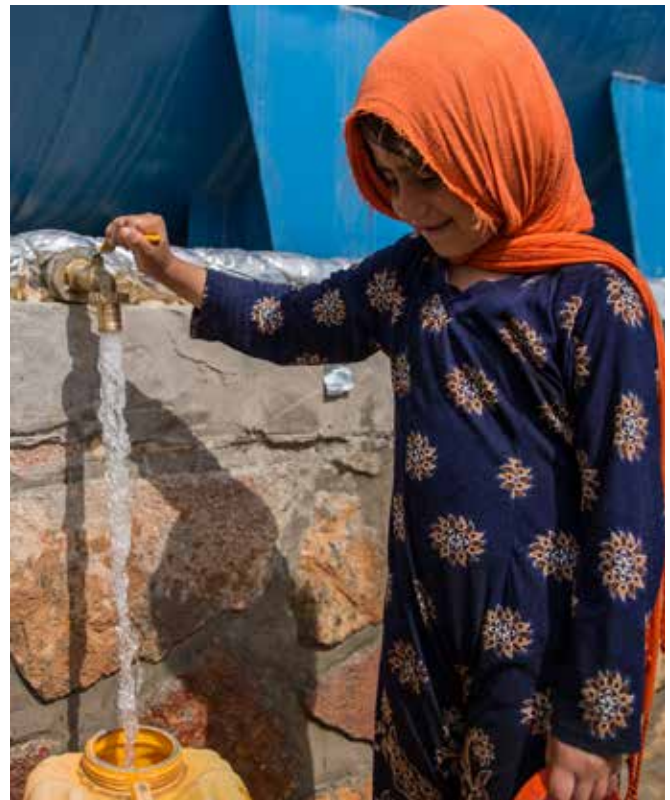
A girl in Chahkaran, Badghis province collects clean drinking water from the village’s new water treatment system which uses reverse osmosis.

water-trucking services immediately, while continuing to scale the RO units in the IDPs’ rural places of origin, working with community members who stayed behind. Extensive advocacy was conducted with the WASH Cluster and donor community, and a full business case was developed to highlight the efficiency and sustainability of the RO units from a cost-benefit perspective. In one of the villages the RO unit worked so efficiently that a peer international NGO used its emergency grant funds from a humanitarian donor to purchase water from the community’s pumps for water trucking to the IDP settlements in Qala-E-Naw.