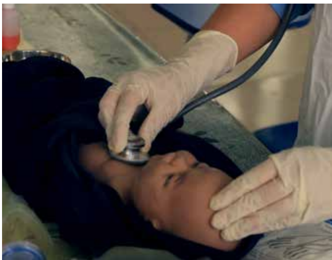
A student practices during her midwifery courses at the Herat Institute of Health Sciences

Family Health Houses (FHHs) represent another initiative across the humanitarian-development nexus. These structures ensure reproductive MNCH services are available in rural areas. Though the Health Post is intended within the BPHS to be the structure closest to community level, Health Posts are staffed by unpaid volunteers and are capable only of providing family planning or routine essential medicines such as