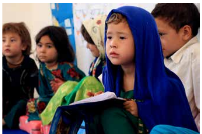
Children engaged in learning at Early Childhood Development (ECD) centres in Badghis.

This case study outlines the lessons learnt from implementing health, water, sanitation and hygiene (WASH) and education programming across the nexus, recognising these three sectors have been heavily affected by COVID-19 in Afghanistan, and provides recommendations for government, donors, the UN and other stakeholders on how to create a more enabling environment for a nexus approach.