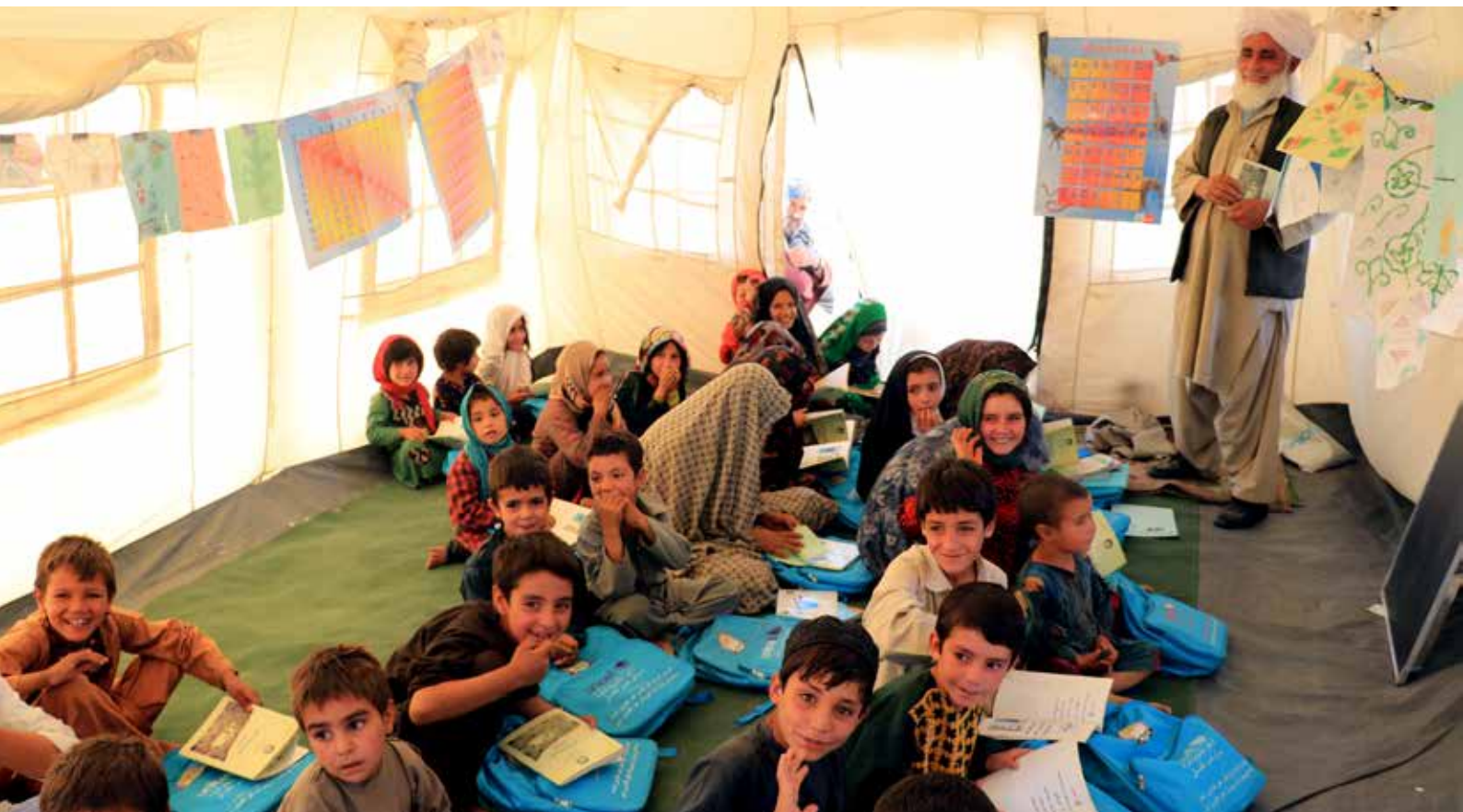
Girls and boys taking studies together from a TLS classroom in an IDP settlement in Badghis, through World Vision's EIE programming.

While it is essential for displaced children to receive education immediately as a means to prevent a gap in learning and cognitive development, as well as to provide a safe and protective space, the use of the TLS approach and the