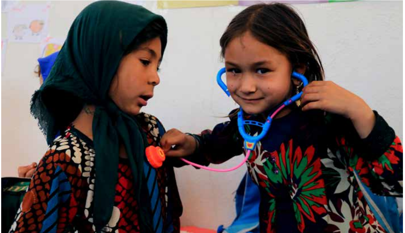
Girls playing together and learning about health in World Vision's education programmes.

The reach of the global pandemic has not spared Afghanistan. According to the Ministry of Public Health (MoPH), by October 2020 over 40,000 people in all 34 provinces have been confirmed to have COVID-19. Due to limited public health resources and testing capacity, as well as the absence of a national death register, confirmed cases of and deaths from COVID-19 are likely to be underreported overall. 15 The pandemic has pushed more people to the brink, increasing the number of people in need of life-saving humanitarian assistance from 9.4 million in December 2019 to 14 million by